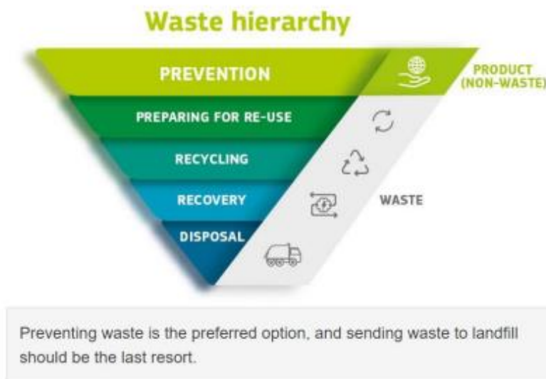
Figure 2: Waste Framework Directive - five step waste hierarchy

2.6 New and emerging policy Several policies are currently being developed following the publication of the RaWS. Launched in December 2018, RaWS is the Government's plan to preserve material resources by minimising waste, promoting resource efficiency and moving towards a circular economy. This will see products kept in use for as long as possible, making it easier to reuse, repair, refurbish or recycle them (as illustrated in Figure 3 below).