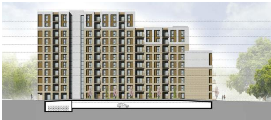
East Elevation Block B