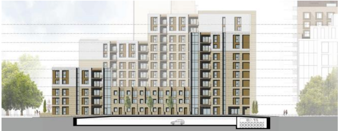
West Elevation Block A