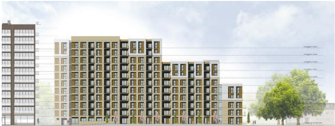
East Elevation Block A