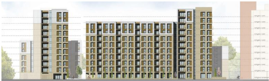
South Elevation Blocks A & B