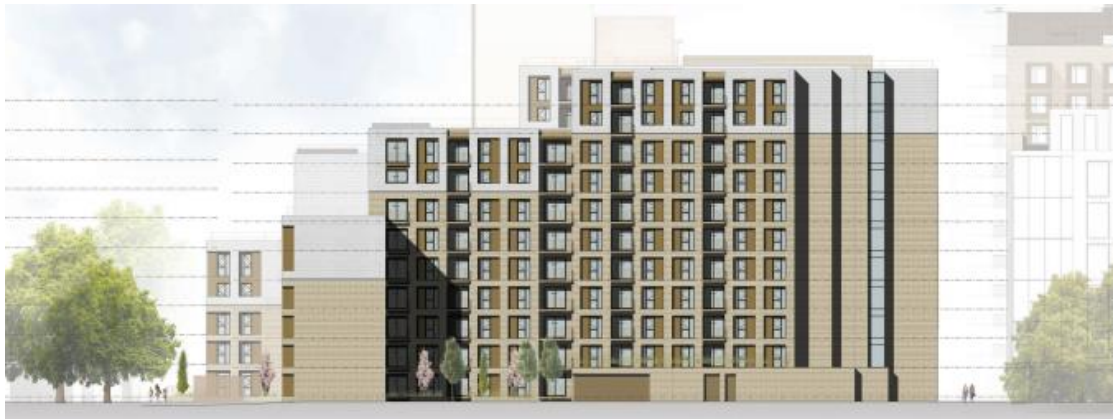
West Elevation Block B