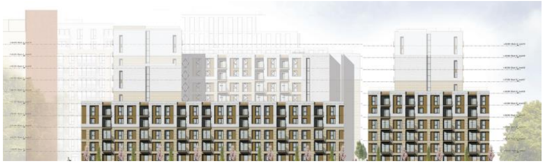
North Elevation Blocks A & B