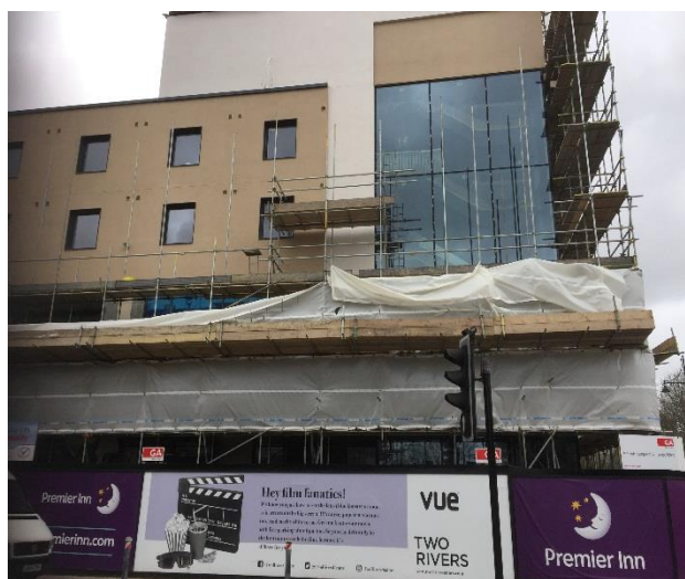
Premier Inn Hotel Staines-upon-Thames (March 2018)