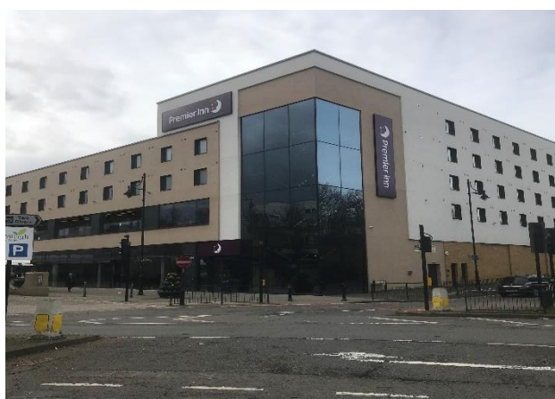
Premier Inn Hotel Staines-upon-Thames (Feb 2020)