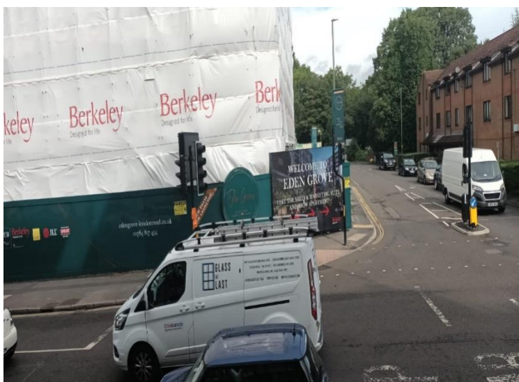
Centrica site – now Eden Grove September 2022