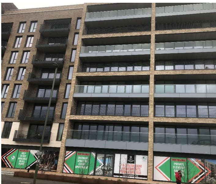
London Square Staines-upon-Thames (Feb 2020)