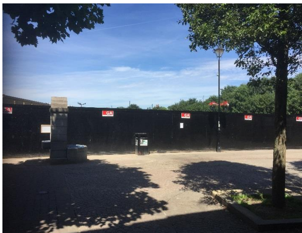
Premier Inn Hotel Staines-upon-Thames (February 2017)