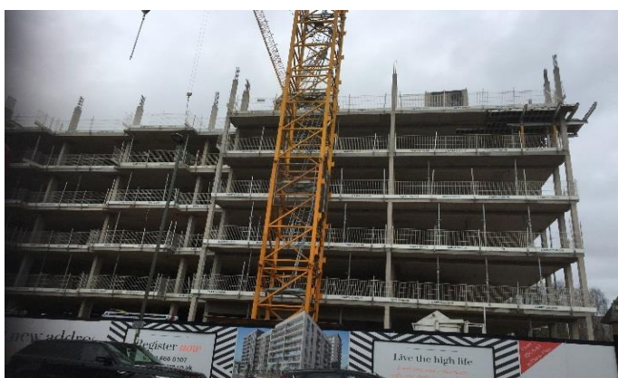
London Square Staines-upon-Thames (March 2018)