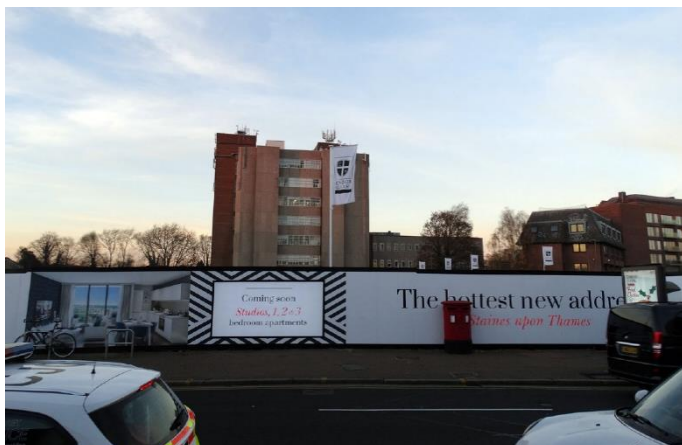
London Square Staines-upon-Thames (February 2017)