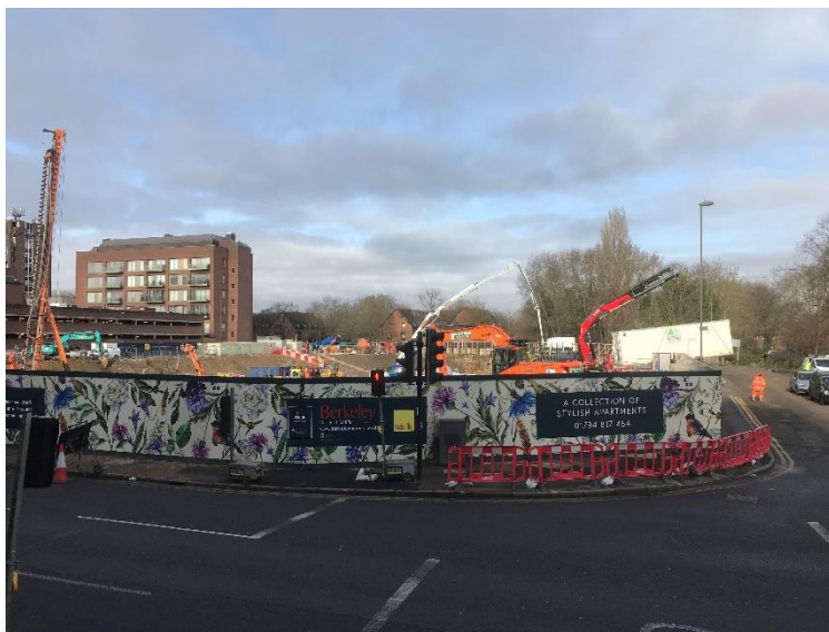
Centrica Site Staines-upon-Thames February 2020