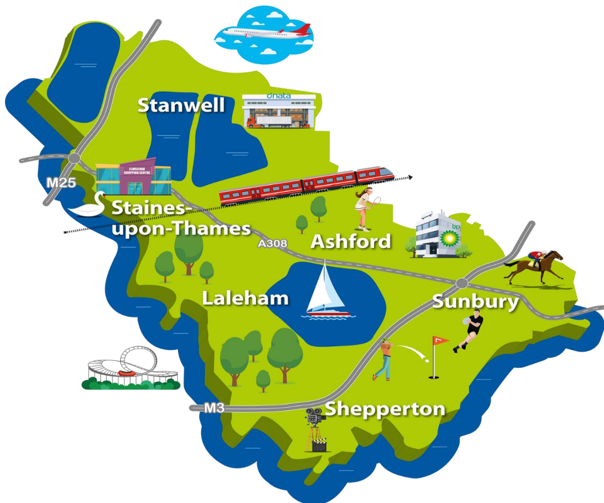
Map 1 Borough of Spelthorne