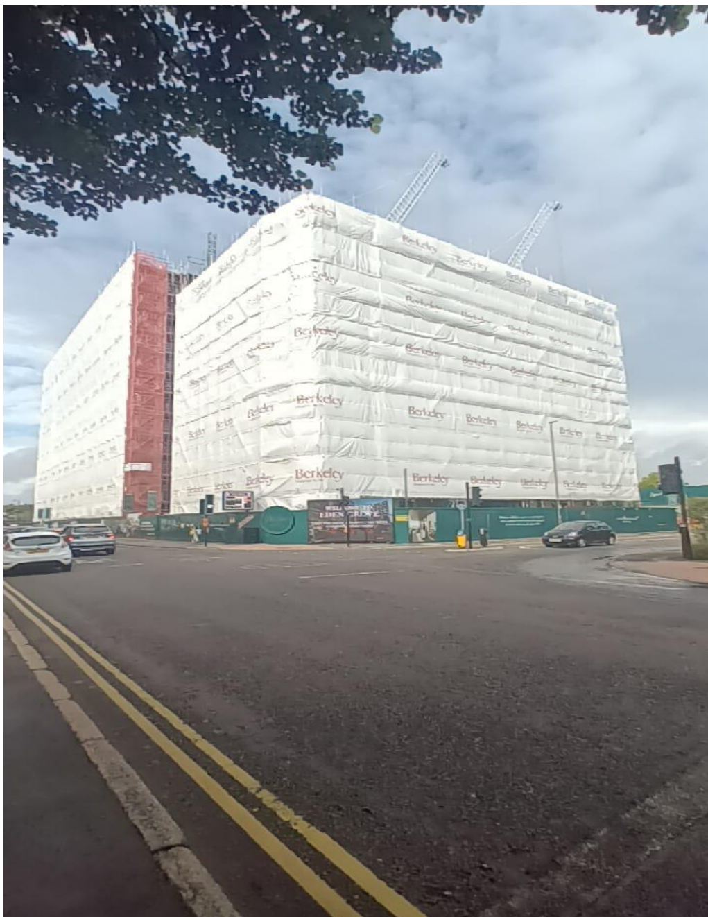
Eden Grove – September 2022