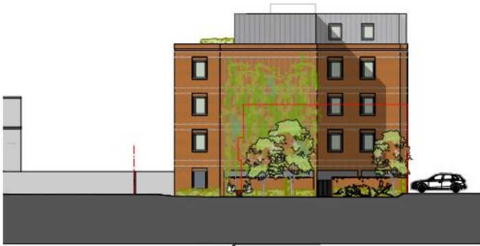
EAST ELEVATION CENTRAL BLOCK