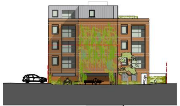
WEST ELEVATION CENTRAL BLOCK