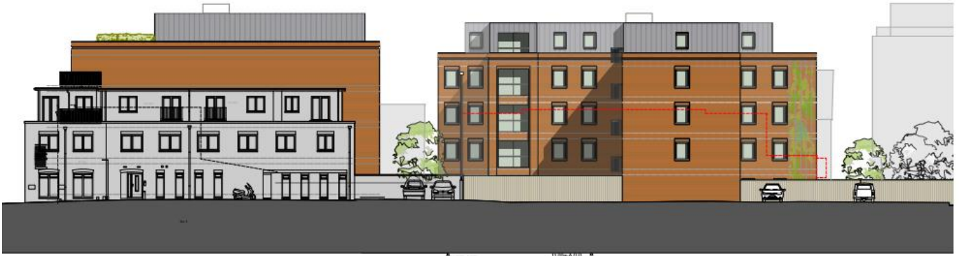
NORTH ELEVATION STATION CAR PARK